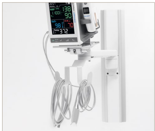
Wall mount with utility hook