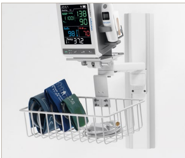
Wall mount with basket

The SC300’s flexibility is enhanced through a choice of mounting options, users can select either a mobile stand with integrated accessory storage, a wall mount option also with a storage capability or an IV pole attachment where space may be limited.